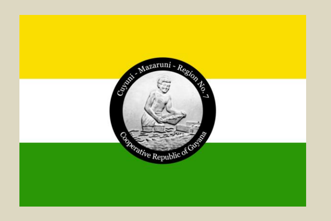
Description Cuyuni-Mazaruni - Region No. 7

The Cuyuni-Mazaruni Region contains two of the four natural regions: forested highlands and a small portion of the hilly sand and clay region.